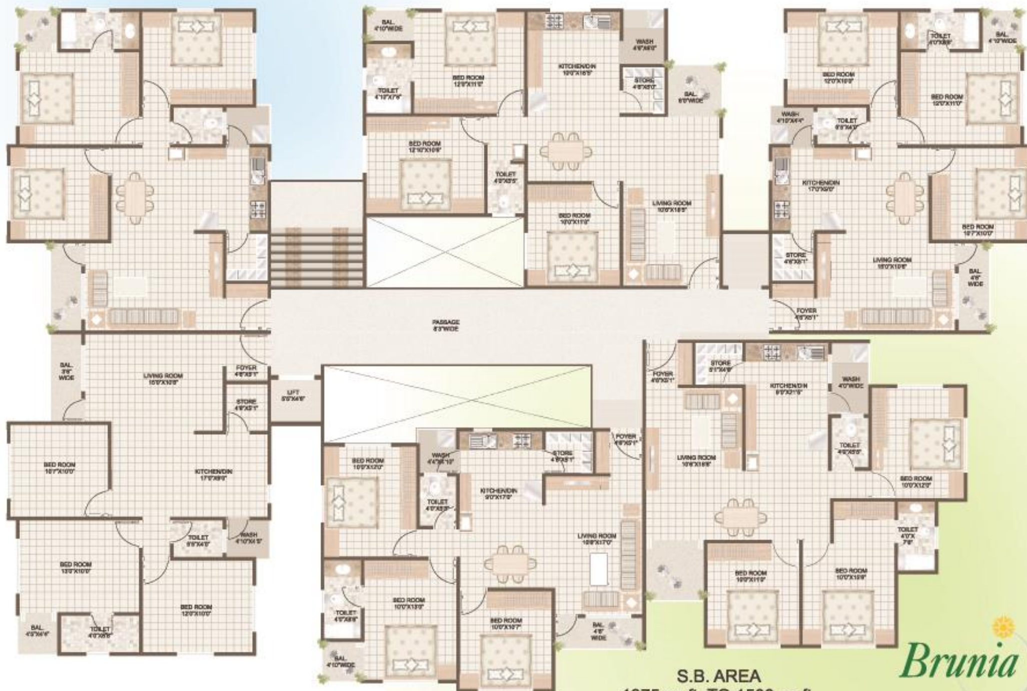
S.B. AREA 1375 sq.ft. TO 1500 sq.ft.